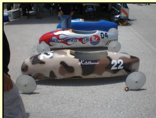
BCC's car #22 driven by Nikki